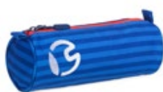
Blue stripes 7049980522075