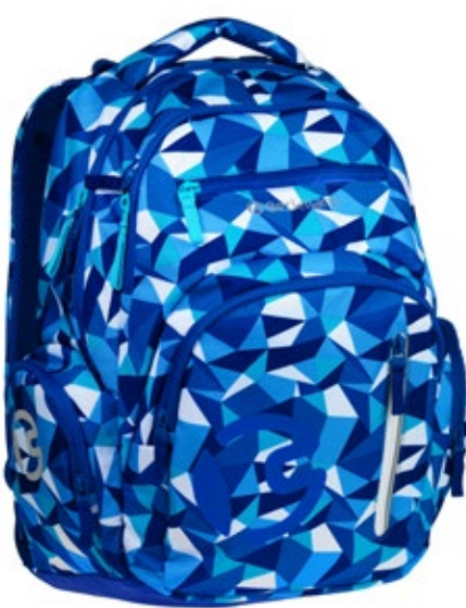
Mixed blue 7049985740269