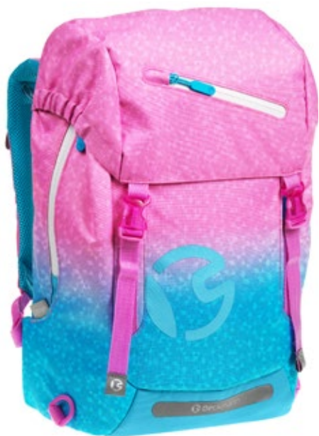
Pink fusion 7049980217124