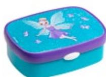
Turquoise Fairy 7049980817232