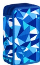
Mixed blue 7049980197266