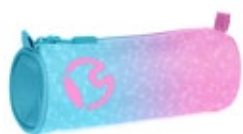
Pink fusion 7049980522129