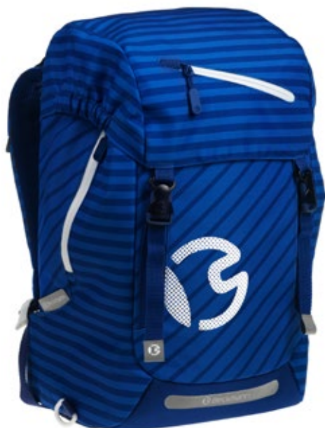
Blue stripes 7049980217070