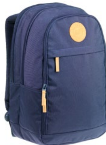
Dark blue 7049985730079