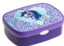
Purple Mindy 7049980817195