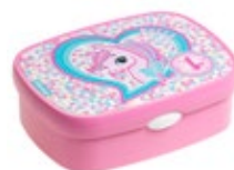
Color Bella 7049980817508