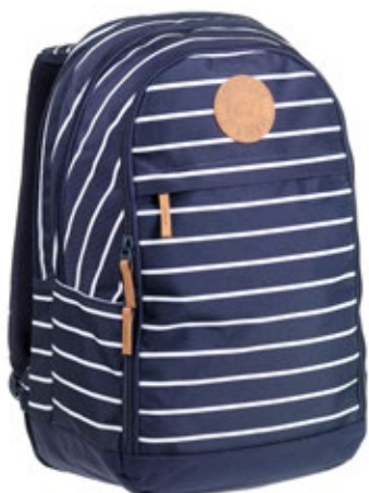
Navy stripes 7049985730178