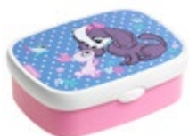
Denim Pet 7049980817812