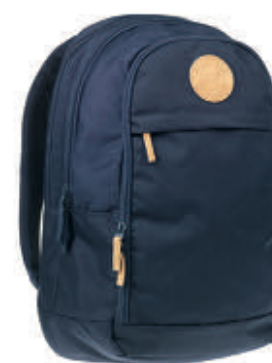
Dark blue 7049985830076