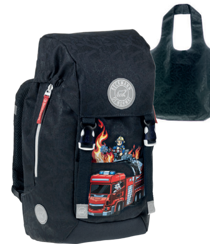
Fire truck 7049980428216