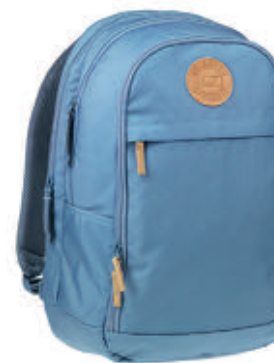
Light blue 7049985830212