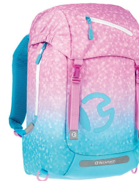
Pink fusion 7049980218121