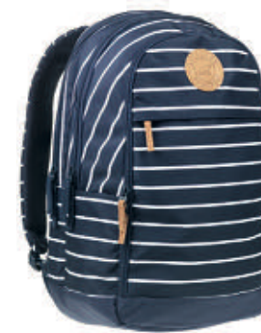
Navy stripes 7049985830175