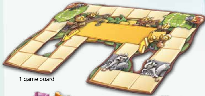
1 game board