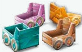
4 wheelbarrows in four colors