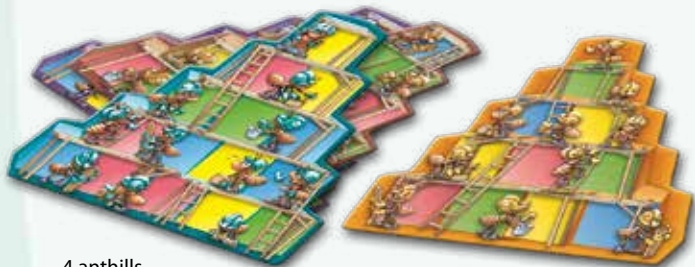
4 anthills (15-block plan on one side, 10-block plan on the other)