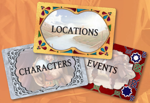
3 Deck Indicator Cards