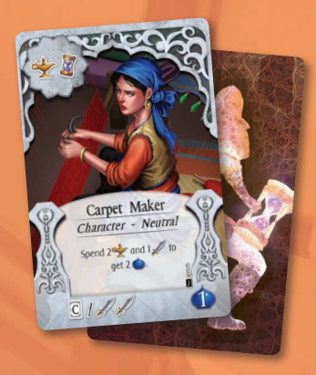
57 Character Cards