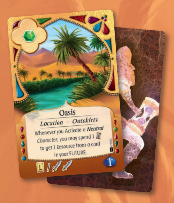
51 Location Cards