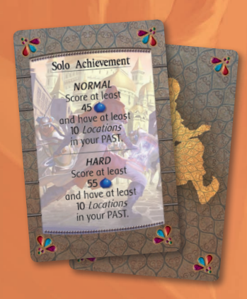
7 Solo Achievement Cards