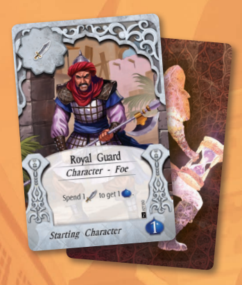
12 Starting Cards