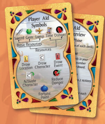
4 Player Aid Cards 1 Solo Player Aid Card